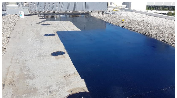
Image 3: Application of primer in progress; before installation of torch on waterproofing membrane system