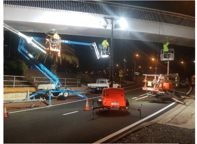
Image1: Coating works in progress during nightshift